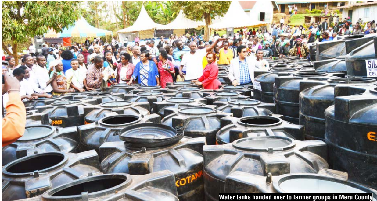
Water tanks handed over to farmer groups in Meru County