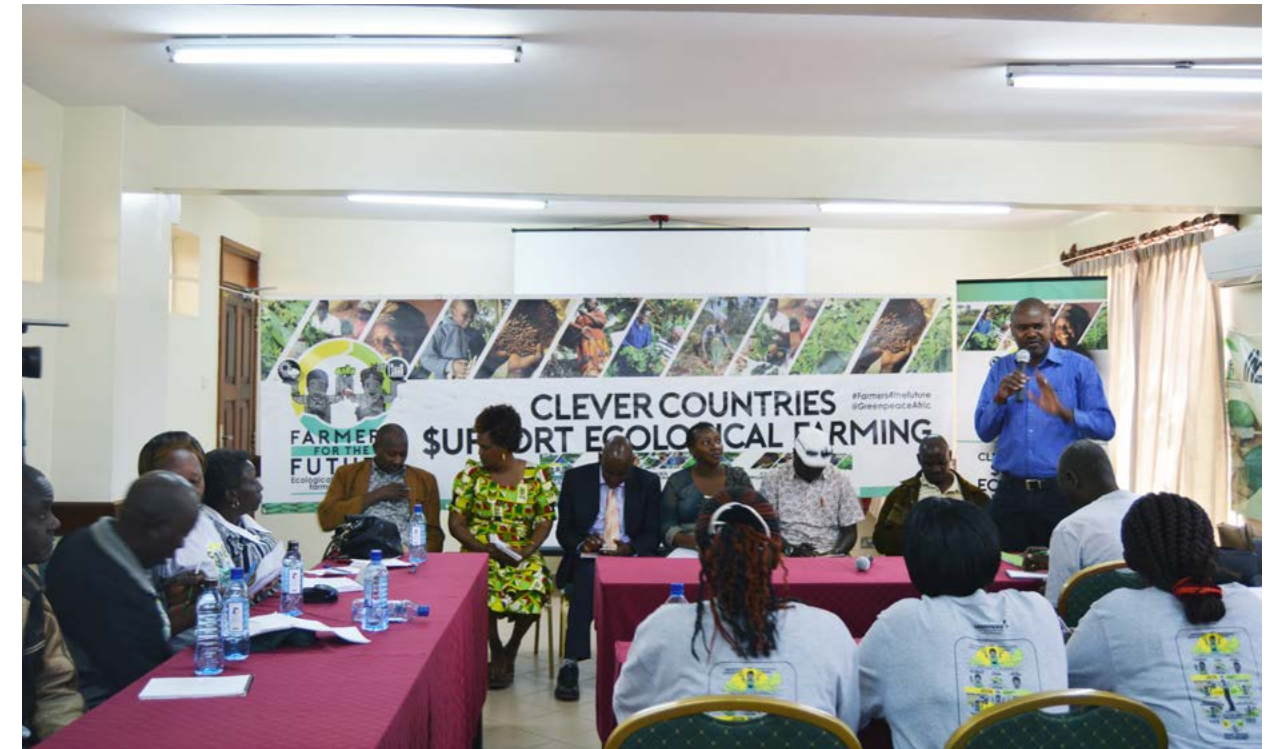
Policy dialogue between ecological farmers and members of county assembly committee - agriculture and environment, Machakos County

This was a campaign that involved mobilization of county leaders in Machakos to create awareness and lobby for supporting environmental conservation as well as ecological farming that support community livelihoods. Farmers had an opportunity to present their views to county legislators. During the period lobby meetings were held with selected key donors and embassies in Kenya whereby petitions were presented by the farmers urging donor support ecological farming systems and sustainable environmental initiatives.