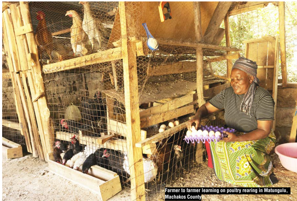
Farmer to farmer learning on poultry rearing in Matungulu, Machakos County

In addition, ICE supported farmers with one hundred and thirty (130) Purdue Improved Crop storage (PICS) bags in Meru, Tharaka and Muranga. The beneficiaries of the PICS bags have reported their effectiveness in keeping cereal harvest safe from pests without using chemicals. The bags are also saving the farmers' incomes which they used to purchase pesticides.