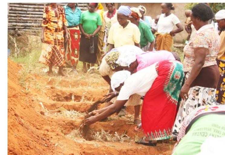
On-farm training on dry-land farming technologies in Yatta, Machakos County