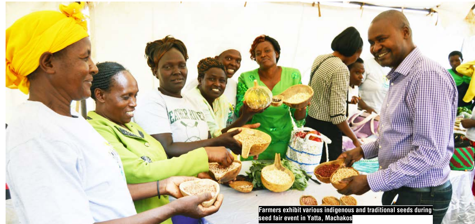
Farmers exhibit various indigenous and traditional seeds during seed fair event in Yatta, Machakos