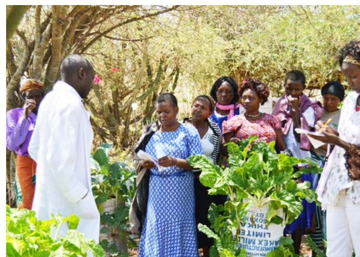
Farmers learn on establishment and management of home garden during experiential learning exchange in Machakos

In addition, ICE facilitated one experiential learning visit in Machakos. These enabled farmers from Matungulu and Yatta sub-counties learn from other farmers practicing sustainable dry-land farming methodologies.