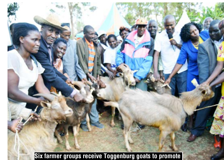
Six farmer groups receive Toggenburg goats to promote diversification in Meru County

Four (4) seed fair events and one farmer exhibition were held in Tharaka-Nithi, Muranga, Embu, Meru and Machakos counties. Farmers show-cased various products from their farms to the wider community and stakeholders. The activity provided a platform for farmers to exhibit their farm enterprises hence broadening market. This also promoted information sharing among the farmers on indigenous seeds management. The events brought together farmers, county and national government officers from ministry of agriculture and environment and national and county policy makers and journalists from local media stations.