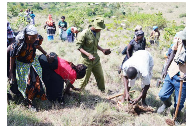
A community-led tree planting initiative at Kilimambogo Hill ecosystem

In efforts to engage young people six (6) schools namely: Maragua and Nginda primary schools in Murang'a; Nthimbiri and Gachua primary schools in Meru, Ndurumoni primary School and Marimanti Girls High School in Tharaka, were identified and supported to undertake environmental conservation initiatives and establish school farm forests.