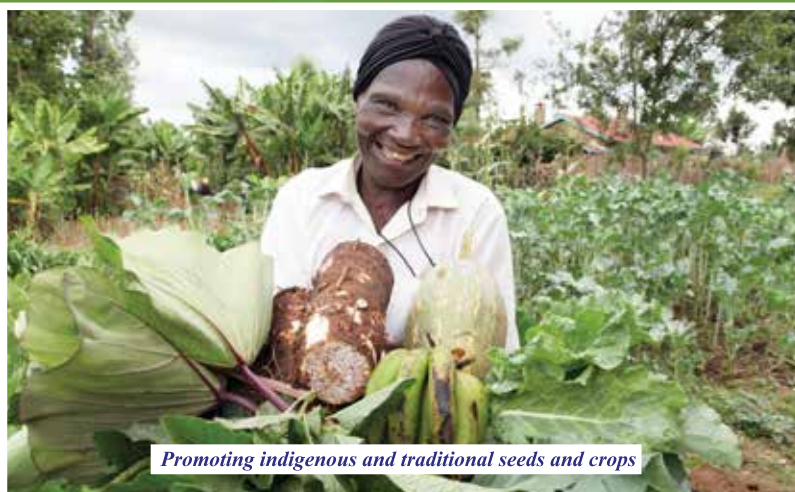
Promoting indigenous and traditional seeds and crops