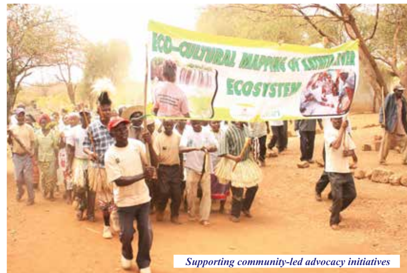
Supporting community-led advocacy initiatives