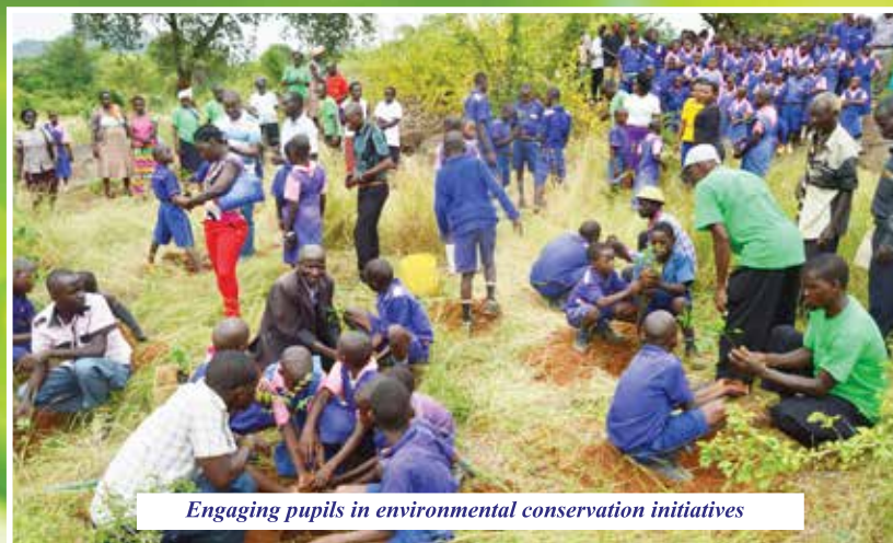
Engaging pupils in environmental conservation initiatives

To empower communities through sound ecosystems management and enhancing their livelihoods