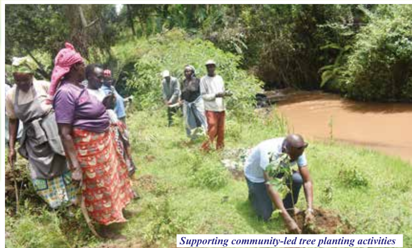
Supporting community-led tree planting activities