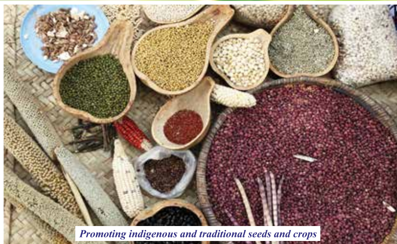
Promoting indigenous and traditional seeds and crops