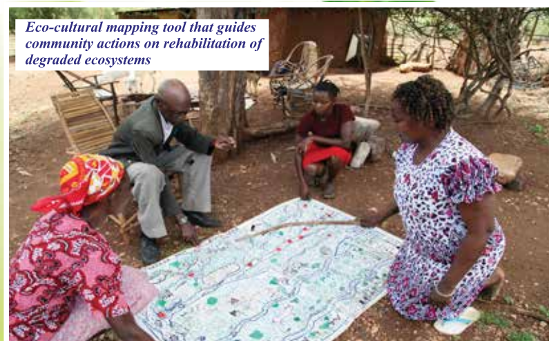
Eco-cultural mapping tool that guides community actions on rehabilitation of degraded ecosystems