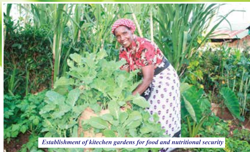
Establishment of kitchen gardens for food and nutritional security