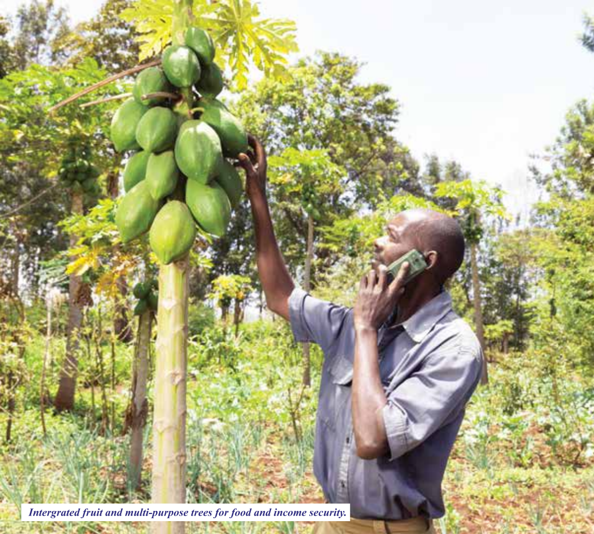
Integrated fruit and multi-purpose trees for food and income security.